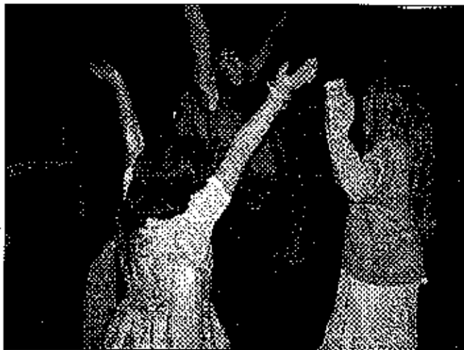
Fun at Friday night's disco!