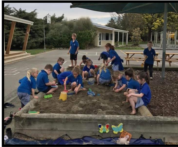
The Fairton school students enjoying the new extended sandpit.