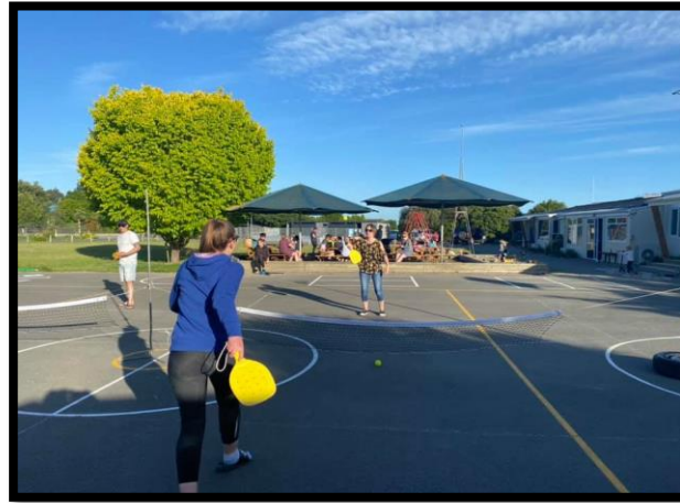
Families enjoying the tennis which was held on the Kids vs Parents Games evening.