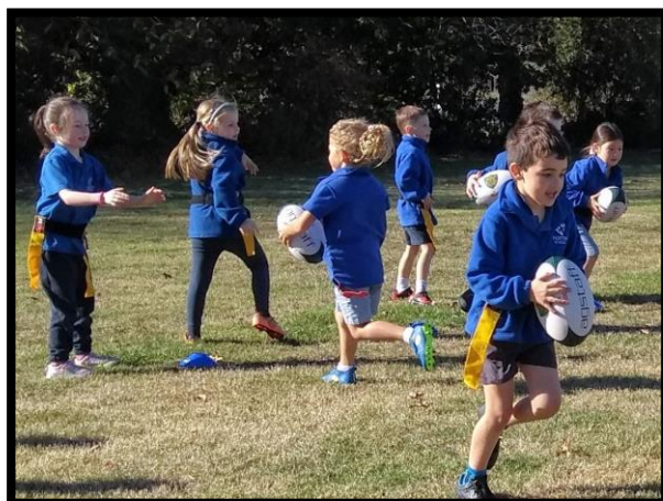
Rugby Skills Action